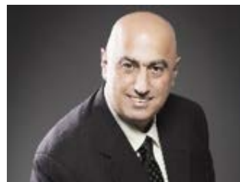
Chairman of SAP User Groups Executive Network (SUGEN)

The first SUGEN face to face meeting for 2016 took place at SAP Headquarters in Walldorf, Germany between June 14th and 16 th . The three days were a great success the result of a partnership effort between SUGEN members and SAP. The encounters were diverse in content from strategic discussions to best practice sessions on operational matters. The 14 SUGEN user groups that attended out of the total 19 SUGEN members had strategic discussion with SAP on topics in areas of SAP Product & Innovation Technology, SAP S/4 HANA, SAP Portfolio, and Value of Maintenance. The SAP Global User Group Organization (GUGO) shared the latest update on the centralization and access to information on user groups on SAP.com. The discussions on SUGEN topics were in critical areas of licensing, innovation adoption, and customer influence. SUGEN had two individual sessions to share user group strategies and the SUGEN future discussions. During the best practice sessions, topics included user groups' relevancy, knowledge transfer, member's engagement, and user groups and SAP listen. The attendance, participation, and discussions were significant from all SUGEN members attending and SAP showing the mutual interest in the partnership to collaborate in a real network.